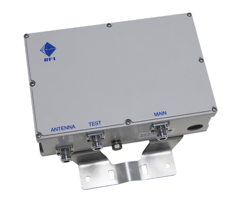
Tower Top Amplifier

A comprehensive microprocessor-controlled status and fault monitoring system provides continuous monitoring and switching of the redundant LNAs. Front panel switches, front panel indicators, and a Form-C relay provide system configuration and fault status functions. The RMC features selectable inline Post Filter connections, and Bypass, Terminated and Test Port functionality is also included to support testing and commissioning. Auto-gain, Auto-Mode, Gain-Boost, Auto-Bypass and Auto-Recover functionality, diagnostics and communication management are also available via an on-board webserver GUI.